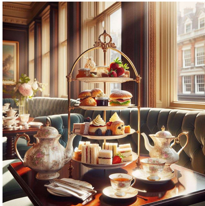
(Afternoon Tea in London as imagined by AI. It ticks quite a few boxes!)

Today, traditional Afternoon Tea is served on a three-tiered stand. It usually comprises crustless sandwiches (including the famous cucumber sandwich; luckily, the private chef to the Earl of Sandwich had invented the snack that could be devoured without cutlery – albeit with a good slice of meat – during a game of poker around 1750. The invention of the sandwich was then followed by a period during which the edges were cut off for refined diners because the bread crust was thought to contain unhealthy particles, and this very fashion is still continued today when serving Afternoon Tea), scones, strawberry jam and clotted cream (i.e. one section of the tier is reserved for a meal that is called cream tea today if served on its own), and sweet treats.